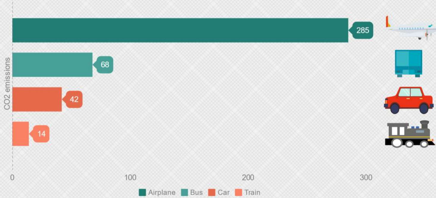
Chart figures as reported by the European Environment Agency

An Energy Management System (EMS) can enhance guest comfort while reducing energy costs by 35% to 45%, for a return on investment of 50% to 75%.